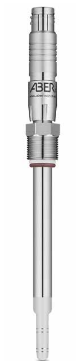
Annular Probe Pre fitted PG 13.5 Nut